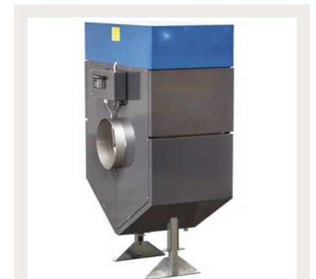
MAXCHANGE condensing exchangers Add-on boiler range 90kW to 2000kW

FOR FULL RANGE SEE: www.atlanticboilers.com FOR DETAILS CONTACT: technicalsales@atlanticboilers.com t: 0161 621 5960 ATLANTIC BOILERS, PO BOX 11, ASHTON UNDER LYNE, OL6 7TR T: 0161 621 5960