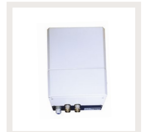
CER modulating electric boilers 1KW to 12kW