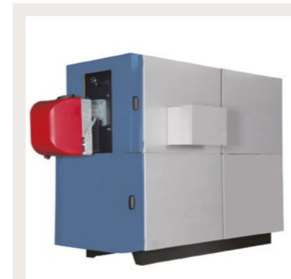
TR-C modulating condensing 3-pass boiler 175kW to 1250kW