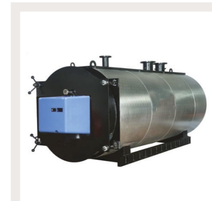
EUROMAX-C super-condensing boiler 1170kW to 5000kW 10BARS