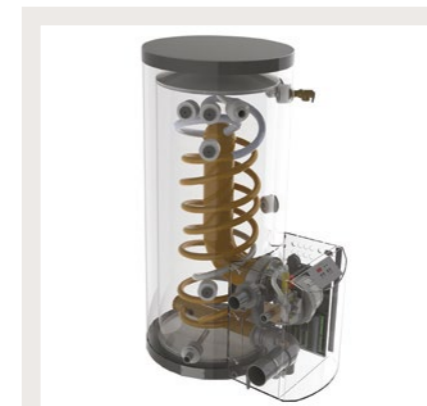
E-TYPE super-condensing water Heaters 17kW to 1000kW