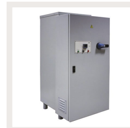
ME-STANDARD electric boilers 7BARSg 90kW to 960kW