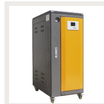
A Y-O electric steam boilers 8 - 1000 kg/hr 10BAR steam

For closed heating systems Maximum working pressure 7BARS