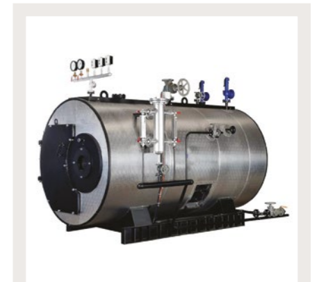
ESB Multi-fuel 3 pass steam boiler 1000 kg/Hr to 30,000 kg/Hr