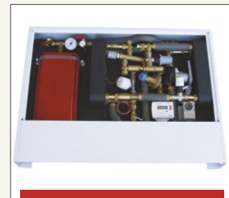
HIU City Range