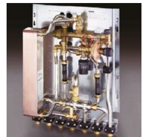
Heat Interface Unit