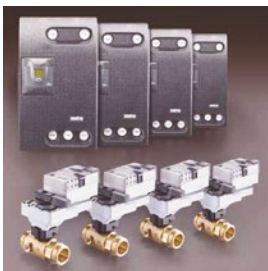
Centralised Hot Water