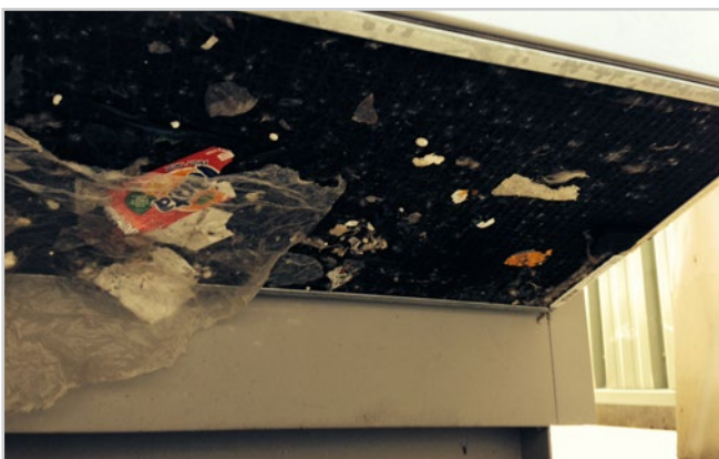
AHU Air Intake after two weeks