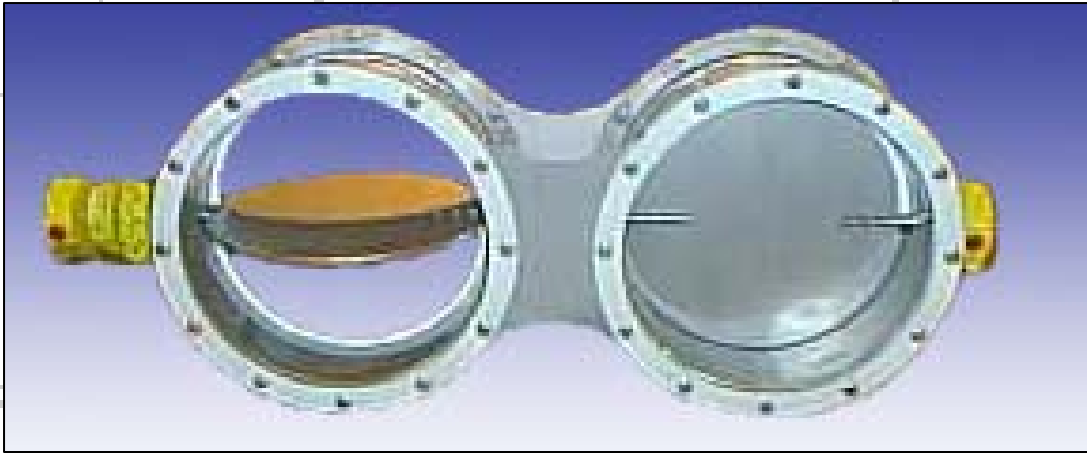
Photograph shows the KDHC Twin

Konvekta has the capability to manufacture customized products: