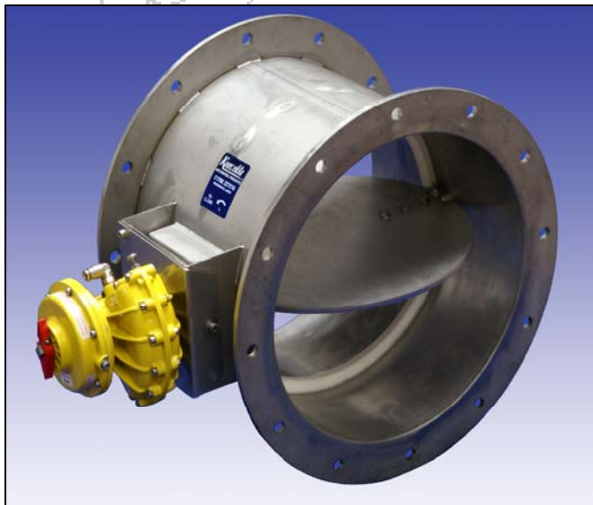
Type KHDC 1

Konvekta Ltd have designed and manufactured a wide range of ventilation products to fulfil all air control requirements. The Konvekta products can be adapted to suit many different applications or tailored to meet specific requirements, providing complete air control solutions