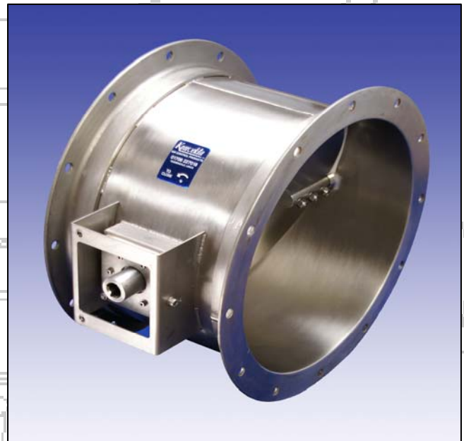
Type KHDC 2

Konvekta Ltd has the technology and expertise to produce products that continually excel on design and application quality